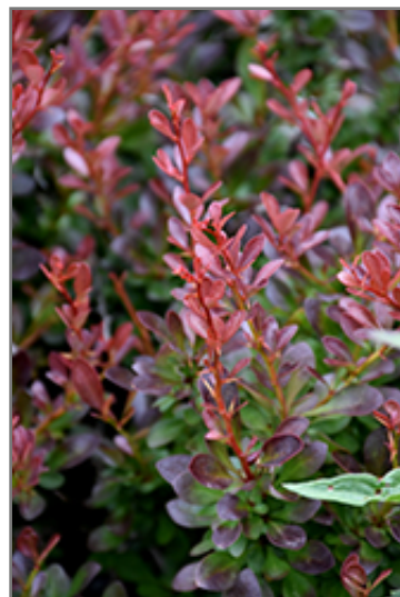
Cabernet Japanese Barberry foliage