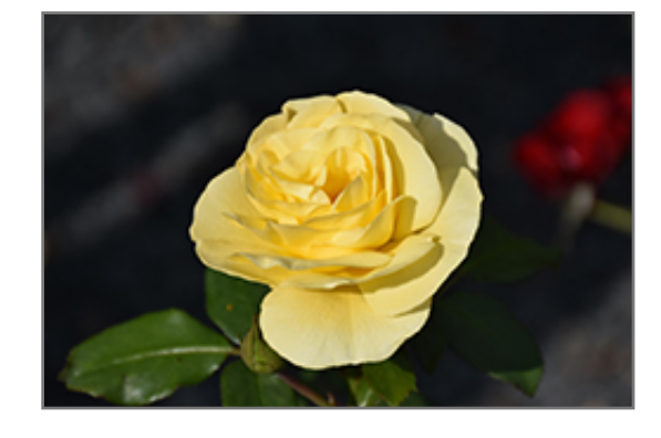
High Voltage Rose flowers