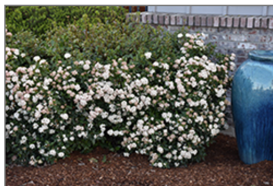
Spring Bouquet Viburnum in bloom