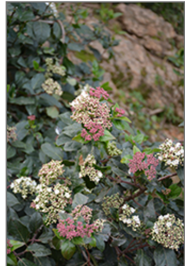
Spring Bouquet Viburnum flower buds

This shrub does best in full sun to partial shade. It prefers to grow in average to moist conditions, and shouldn't be allowed to dry out. It is not particular as to soil type or pH, and is able to handle environmental salt. It is highly tolerant of urban pollution and will even thrive in inner city environments, and will benefit from being planted in a relatively sheltered location. This is a selected variety of a species not originally from North America.