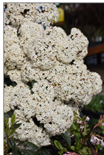
Spring Bouquet Viburnum flowers

Spring Bouquet Viburnum is a multi-stemmed evergreen shrub with an upright spreading habit of growth. Its relatively coarse texture can be used to stand it apart from other landscape plants with finer foliage.