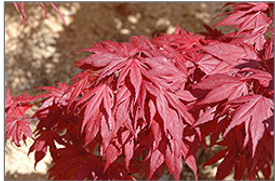
Oregon Sunset Japanese Maple foliage

A compact and round dwarf variety with graceful soft red foliage in spring that darkens to burgundy in summer; fall color brightens to sunset hues of crimson and orange; excellent as a small garden accent