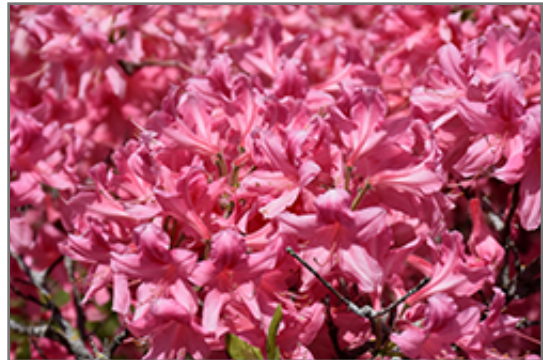
Rosy Lights Azalea flowers

Rosy Lights Azalea is recommended for the following landscape applications;