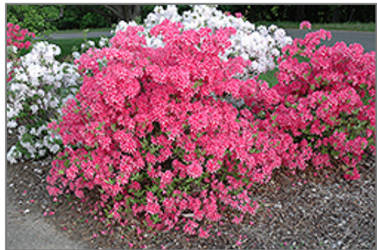
Rosy Lights Azalea in bloom