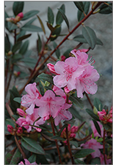
Aglo Rhododendron flowers

Aglo Rhododendron will grow to be about 3 feet tall at maturity, with a spread of 3 feet. It has a low canopy. It grows at a slow rate, and under ideal conditions can be expected to live for 40 years or more.