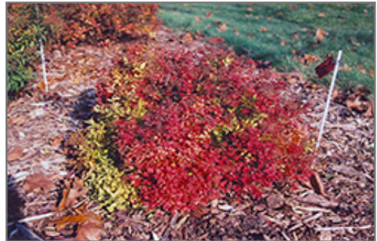
Dakota Goldcharm Spirea in fall

This shrub should only be grown in full sunlight. It prefers to grow in average to moist conditions, and shouldn't be allowed to dry out. It is not particular as to soil type or pH. It is highly tolerant of urban pollution and will even thrive in inner city environments. This is a selected variety of a species not originally from North America.