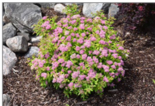
Dakota Goldcharm Spirea in bloom