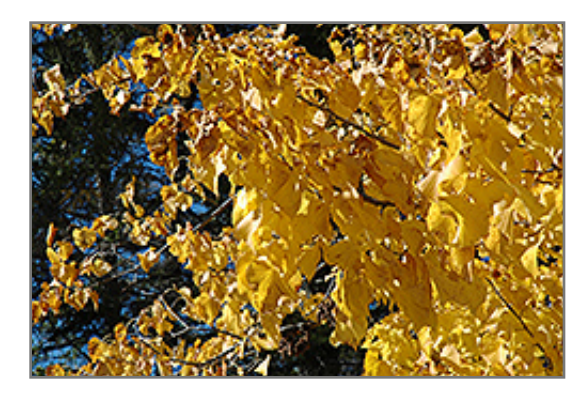
Redmond Linden in fall