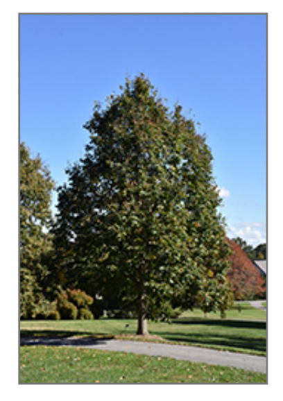
Redmond Linden

This is a relatively low maintenance tree, and is best pruned in late winter once the threat of extreme cold has passed. It is a good choice for attracting bees to your yard. Gardeners should be aware of the following characteristic(s) that may warrant special consideration;