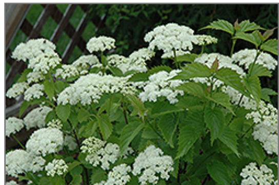
Blue Muffin Viburnum flowers