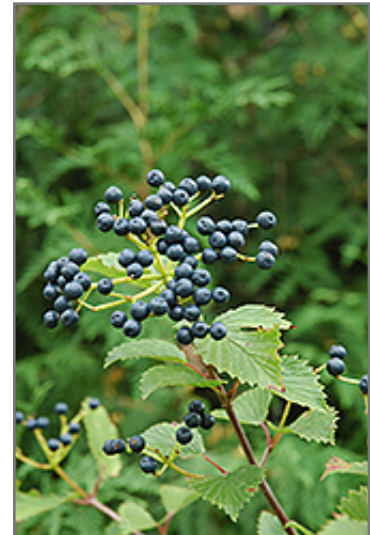
Blue Muffin Viburnum fruit

Blue Muffin Viburnum is a multi-stemmed deciduous shrub with an upright spreading habit of growth. Its average texture blends into the landscape, but can be balanced by one or two finer or coarser trees or shrubs for an effective composition.