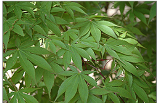
Osakazuki Japanese Maple foliage

Osakazuki Japanese Maple is an open deciduous tree with a more or less rounded form. Its average texture blends into the landscape, but can be balanced by one or two finer or coarser trees or shrubs for an effective composition.