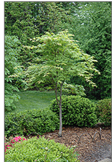
Osakazuki Japanese Maple