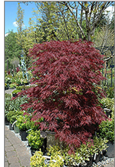
Red Dragon Japanese Maple

Red Dragon Japanese Maple is a fine choice for the yard, but it is also a good selection for planting in outdoor pots and containers. Because of its height, it is often used as a 'thriller' in the 'spiller-thriller-filler' container combination; plant it near the center of the pot, surrounded by smaller plants and those that spill over the edges. It is even sizeable enough that it can be grown alone in a suitable container. Note that when grown in a container, it may not perform exactly as indicated on the tag - this is to be expected. Also note that when growing plants in outdoor containers and baskets, they may require more frequent waterings than they would in the yard or garden.