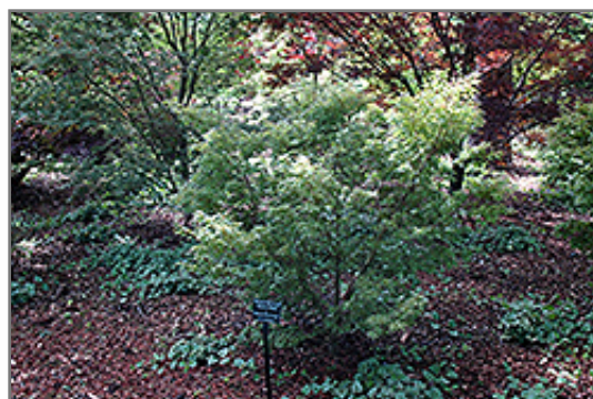
Wilson's Pink Dwarf Japanese Maple

This fine dwarf variety features dense compact branching foliage that emerges a radiant pink, then turns green with yellow tones through summer; outstanding orange-red in fall; a highly desirable specimen for the garden or landscape