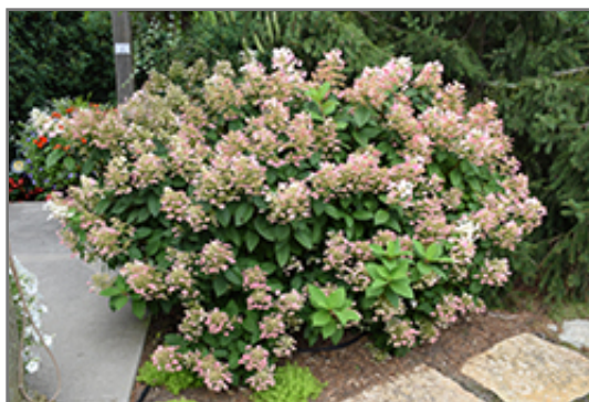
Little Quick Fire Hydrangea in bloom