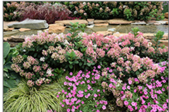
Little Quick Fire Hydrangea in bloom

Little Quick Fire Hydrangea makes a fine choice for the outdoor landscape, but it is also well-suited for use in outdoor pots and containers. With its upright habit of growth, it is best suited for use as a 'thriller' in the 'spiller-thriller-filler' container combination; plant it near the center of the pot, surrounded by smaller plants and those that spill over the edges. It is even sizeable enough that it can be grown alone in a suitable container. Note that when grown in a container, it may not perform exactly as indicated on the tag - this is to be expected. Also note that when growing plants in outdoor containers and baskets, they may require more frequent waterings than they would in the yard or garden.