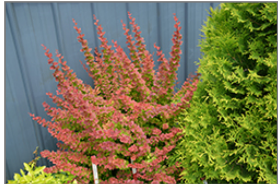
Sunjoy Tangelo Japanese Barberry

Sunjoy Tangelo Japanese Barberry will grow to be about 4 feet tall at maturity, with a spread of 4 feet. It tends to fill out right to the ground and therefore doesn't necessarily require facer plants in front. It grows at a medium rate, and under ideal conditions can be expected to live for approximately 20 years.