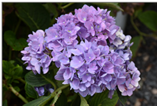
Cityline Rio Hydrangea flowers

A tidy shrub producing long lasting ball-shaped, violet-blue blooms; ideal for the shrub border or foundation garden; perfect indoor accent or patio plant; soil pH affects bloom color