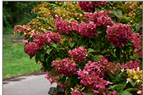
Diamond Rouge Hydrangea flowers

This shrub performs well in both full sun and full shade. It prefers to grow in average to moist conditions, and shouldn't be allowed to dry out. It is not particular as to soil type or pH. It is highly tolerant of urban pollution and will even thrive in inner city environments. Consider applying a thick mulch around the root zone in winter to protect it in exposed locations or colder microclimates. This is a selected variety of a species not originally from North America.