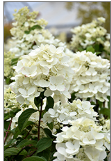
Diamond Rouge Hydrangea flowers