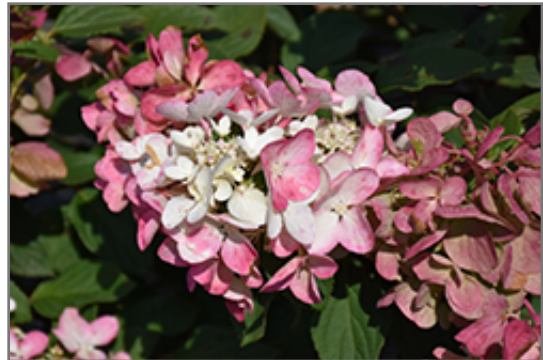
Diamond Rouge Hydrangea flowers

Diamond Rouge Hydrangea is recommended for the following landscape applications;