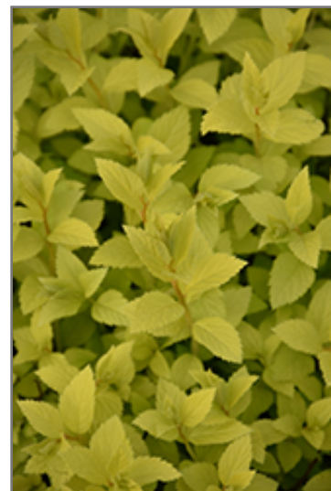
Double Play Gold Spirea foliage

This shrub should only be grown in full sunlight. It prefers to grow in average to moist conditions, and shouldn't be allowed to dry out. It is not particular as to soil type or pH. It is highly tolerant of urban pollution and will even thrive in inner city environments. This is a selected variety of a species not originally from North America.