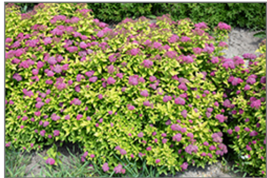
Double Play Gold Spirea in bloom