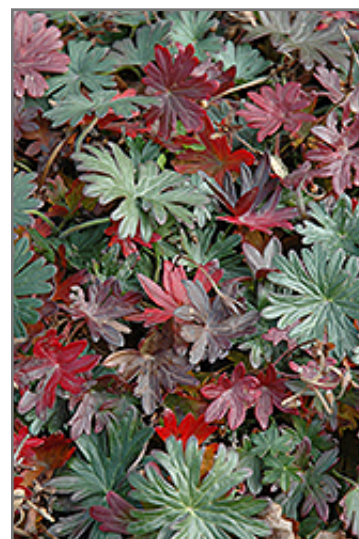
Bloody Cranesbill in fall

Bloody Cranesbill is a fine choice for the garden, but it is also a good selection for planting in outdoor pots and containers. It is often used as a 'filler' in the 'spiller-thriller-filler' container combination, providing a mass of flowers against which the thriller plants stand out. Note that when growing plants in outdoor containers and baskets, they may require more frequent waterings than they would in the yard or garden.