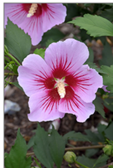
Orchid Satin Rose of Sharon flowers

Orchid Satin Rose of Sharon is recommended for the following landscape applications;