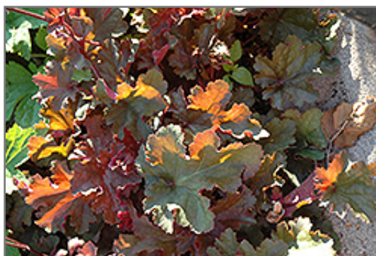
Chocolate Ruffles Coral Bells foliage