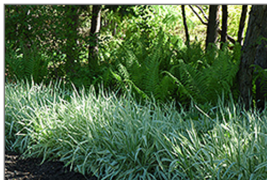
Variegated Ribbon Grass foliage