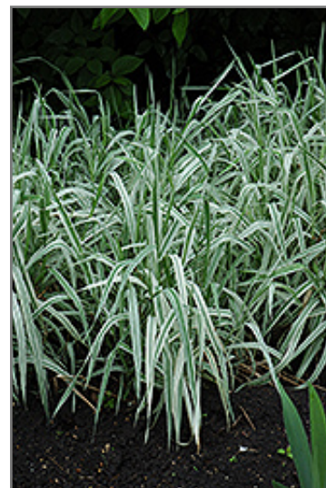
Variegated Ribbon Grass foliage