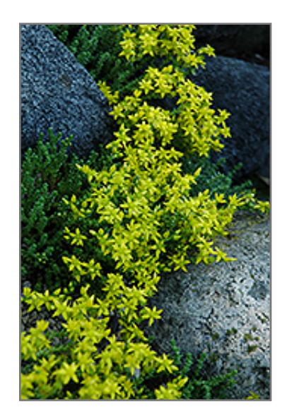
Six Row Stonecrop flowers