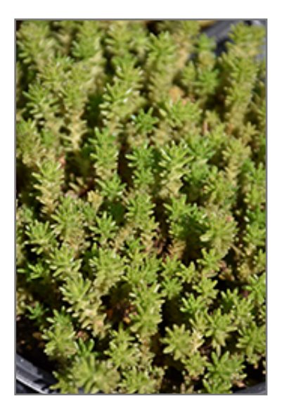
Six Row Stonecrop foliage

This plant does best in full sun to partial shade. It prefers dry to average moisture levels with very well-drained soil, and will often die in standing water. It is considered to be drought-tolerant, and thus makes an ideal choice for a low-water garden or xeriscape application. It is not particular as to soil pH, but grows best in poor soils, and is able to handle environmental salt. It is highly tolerant of urban pollution and will even thrive in inner city environments. This species is not originally from North America. It can be propagated by division.