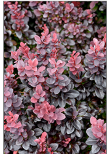
Concorde Japanese Barberry foliage