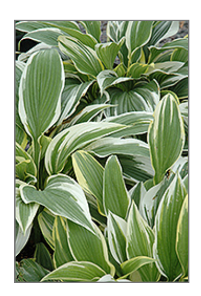
White-Variegated Hosta foliage

Low growing mounds of large, dark green leaves with white margins, create a perfect backdrop for shaded gardens and borders; lilac-pale lavender flowers rise above during the mid to late summer; easy to grow and low maintenance