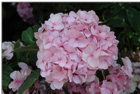
All Summer Beauty Hydrangea flowers