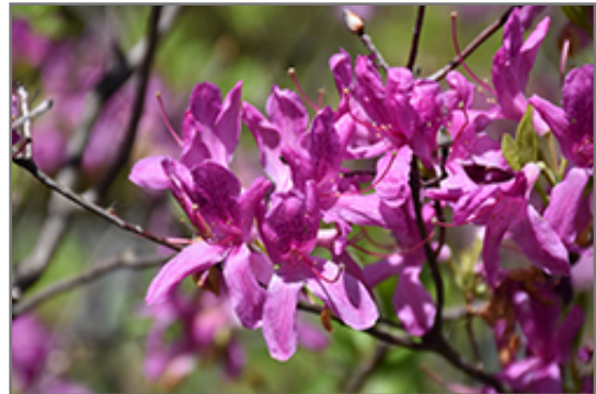
Lilac Lights Azalea flowers

Lilac Lights Azalea is recommended for the following landscape applications;