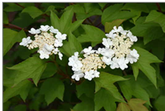
Redwing Highbush Cranberry flowers