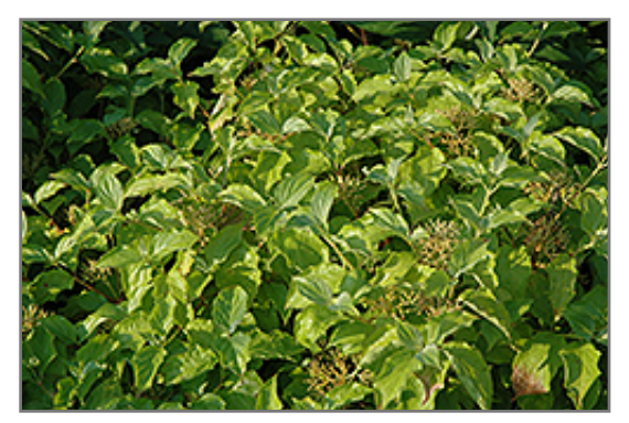
Arctic Sun Dogwood foliage

11606 W. 179th Street Mokena, Illinois 60448 • 708.349.6989 • www.jimmelkalandscaping.com