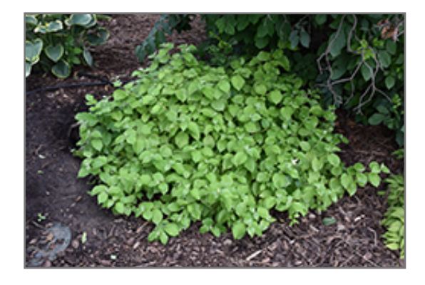
Arctic Sun Dogwood

This shrub will require occasional maintenance and upkeep, and is best pruned in late winter once the threat of extreme cold has passed. It is a good choice for attracting birds to your yard. Gardeners should be aware of the following characteristic(s) that may warrant special consideration;