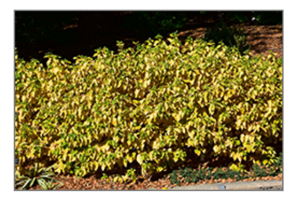
Arctic Sun Dogwood in fall

Arctic Sun Dogwood will grow to be about 4 feet tall at maturity, with a spread of 4 feet. It tends to fill out right to the ground and therefore doesn't necessarily require facer plants in front. It grows at a medium rate, and under ideal conditions can be expected to live for approximately 20 years.