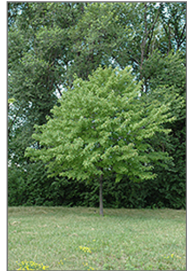
Ruby Frost Red Maple

This tree should only be grown in full sunlight. It is quite adaptable, preferring to grow in average to wet conditions, and will even tolerate some standing water. It is not particular as to soil type, but has a definite preference for acidic soils, and is subject to chlorosis (yellowing) of the foliage in alkaline soils. It is somewhat tolerant of urban pollution. This is a selection of a native North American species.