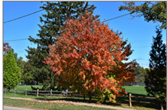
Ruby Frost Red Maple in fall

Ruby Frost Red Maple is recommended for the following landscape applications;