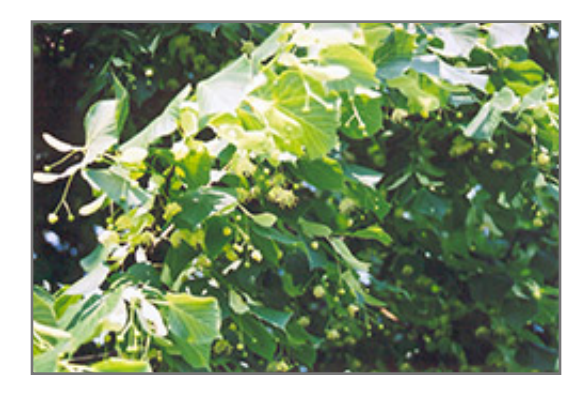
Littleleaf Linden flowers

11606 W. 179th Street Mokena, Illinois 60448 • 708.349.6989 • www.jimmelkalandscaping.com