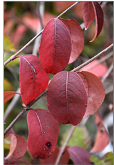
Blackhaw Viburnum in fall

This shrub does best in full sun to partial shade. It is very adaptable to both dry and moist locations, and should do just fine under average home landscape conditions. It is not particular as to soil type or pH. It is highly tolerant of urban pollution and will even thrive in inner city environments. This species is native to parts of North America.