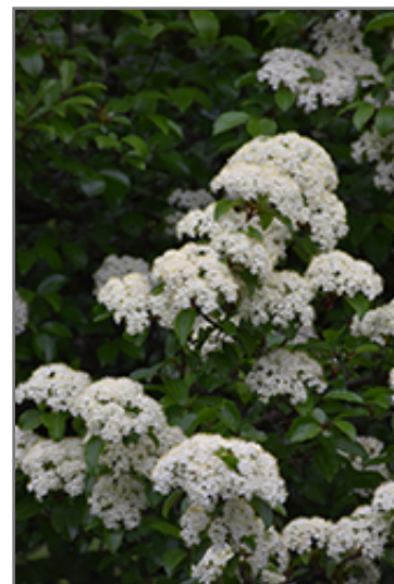
Blackhaw Viburnum flowers

This is a relatively low maintenance shrub, and should only be pruned after flowering to avoid removing any of the current season's flowers. It is a good choice for attracting birds to your yard, but is not particularly attractive to deer who tend to leave it alone in favor of tastier treats. It has no significant negative characteristics.