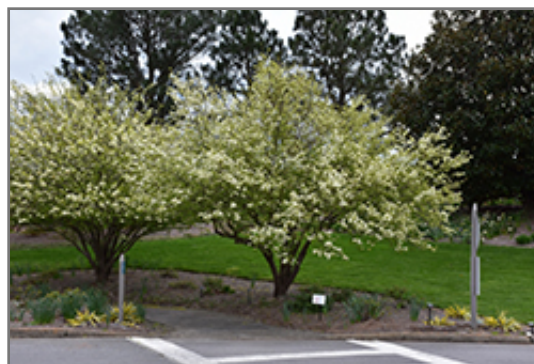
Blackhaw Viburnum in bloom