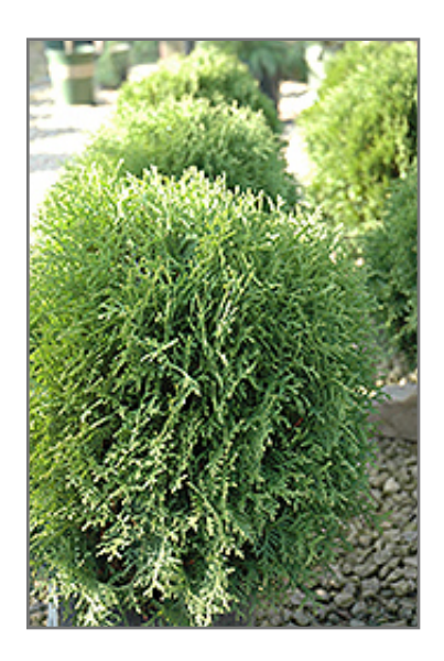
Pygmy Globe Arborvitae