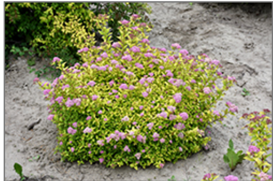
Sundrop Spirea in bloom