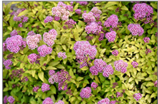
Sundrop Spirea flowers

Sundrop Spirea is recommended for the following landscape applications;