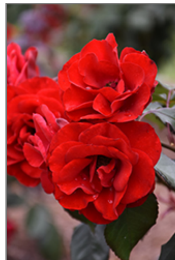
Europeana Rose flowers