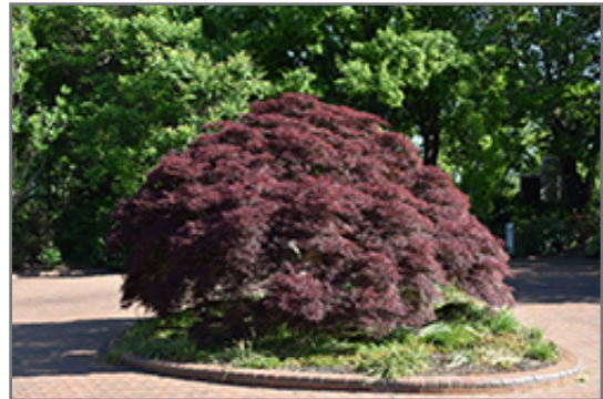
Purple-Leaf Threadleaf Japanese Maple

This is a relatively low maintenance shrub, and should only be pruned in summer after the leaves have fully developed, as it may 'bleed' sap if pruned in late winter or early spring. It has no significant negative characteristics.