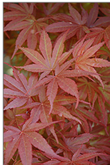
Pixie Dwarf Japanese Maple foliage