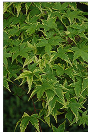
Sagara Nishiki Japanese Maple foliage

Sagara Nishiki Japanese Maple is recommended for the following landscape applications;