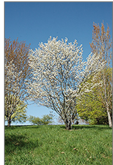
Princess Diana Serviceberry in bloom