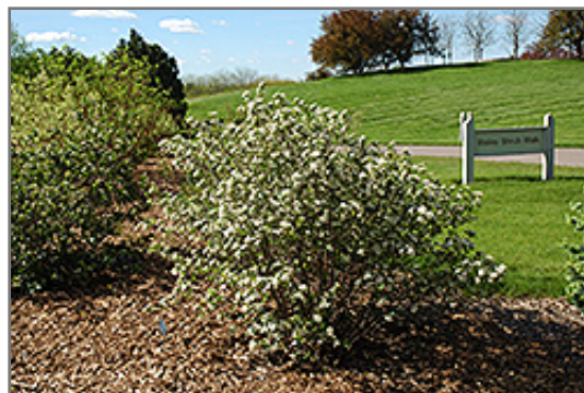
Autumn Magic Black Chokeberry in bloom