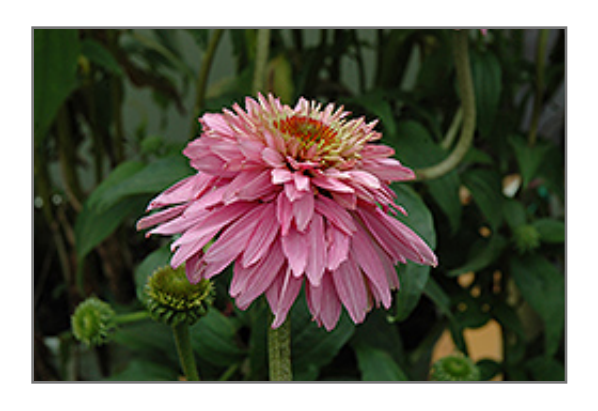
Pink Poodle Coneflower flowers