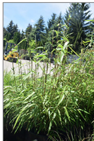
Rufa Clump Bamboo

Rufa Clump Bamboo is recommended for the following landscape applications;