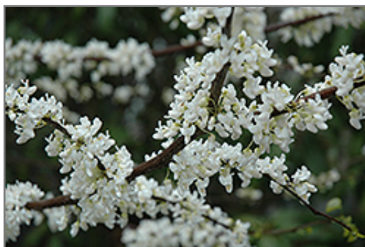
White Redbud flowers