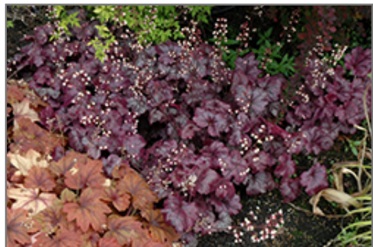
Plum Royale Coral Bells in bloom