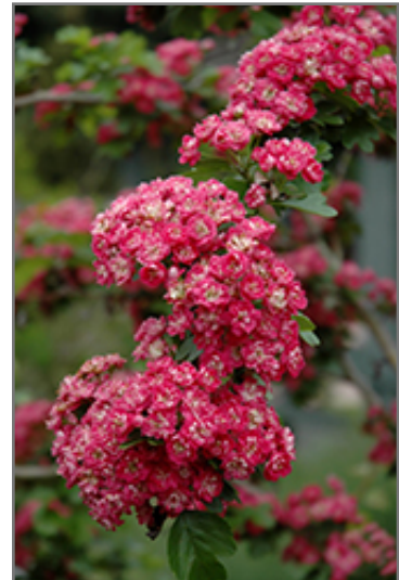
Toba Hawthorn flowers