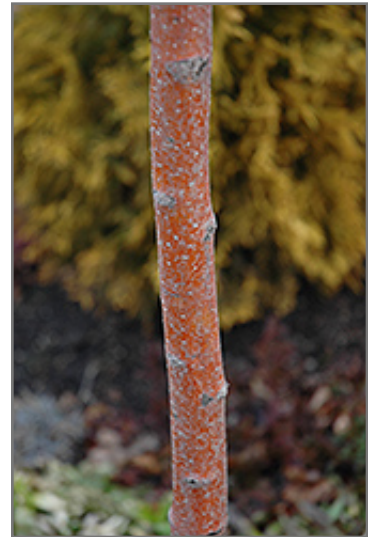
Toba Hawthorn bark

This tree does best in full sun to partial shade. It is very adaptable to both dry and moist growing conditions, but will not tolerate any standing water. It is not particular as to soil type or pH. It is somewhat tolerant of urban pollution. This particular variety is an interspecific hybrid.