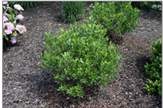
Nordic Inkberry Holly