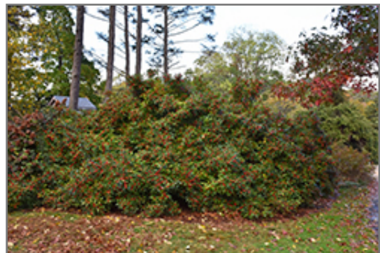
Winter Red Winterberry fruit