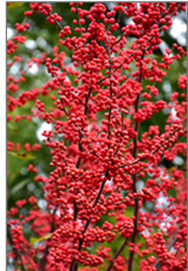
Winter Red Winterberry fruit

This shrub will require occasional maintenance and upkeep, and is best pruned in late winter once the threat of extreme cold has passed. It is a good choice for attracting birds to your yard. Gardeners should be aware of the following characteristic(s) that may warrant special consideration;