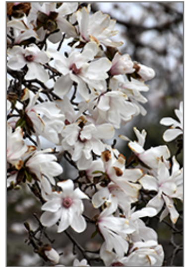
Merrill Magnolia flowers

This tree does best in full sun to partial shade. It requires an evenly moist well-drained soil for optimal growth, but will die in standing water. It is not particular as to soil type, but has a definite preference for acidic soils. It is quite intolerant of urban pollution, therefore inner city or urban streetside plantings are best avoided. Consider applying a thick mulch around the root zone in winter to protect it in exposed locations or colder microclimates. This particular variety is an interspecific hybrid.