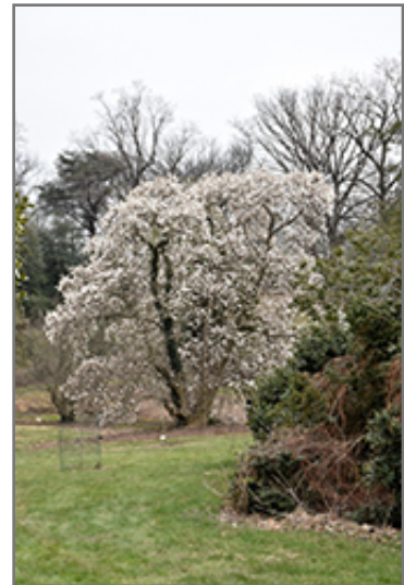
Merrill Magnolia in bloom