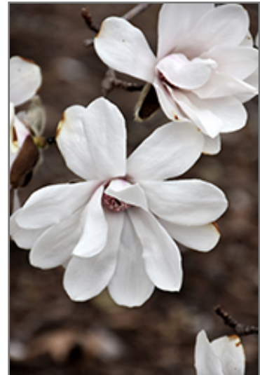
Merrill Magnolia flowers