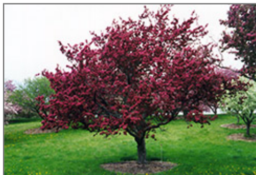
Profusion Flowering Crab in bloom