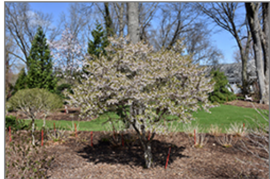
Kojo No Mai Fuji Cherry in bloom

Kojo No Mai Fuji Cherry is a multi-stemmed deciduous shrub with an upright spreading habit of growth. Its average texture blends into the landscape, but can be balanced by one or two finer or coarser trees or shrubs for an effective composition.