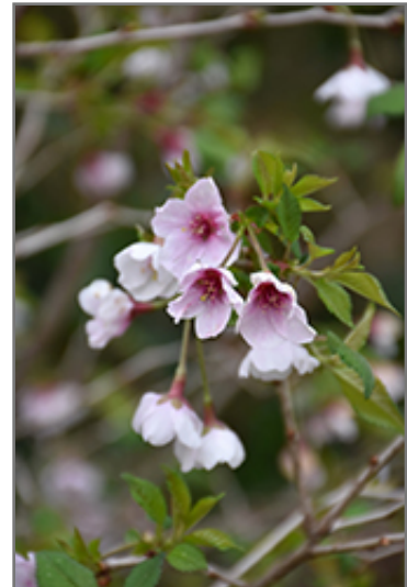
Kojo No Mai Fuji Cherry flowers